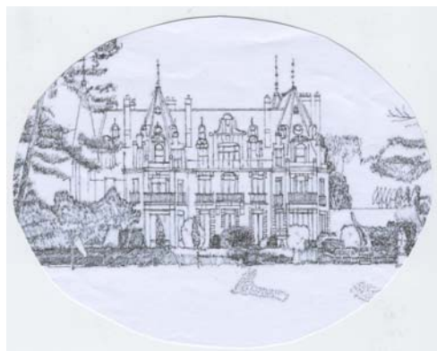
The Chateau Impney Hotel

There are seven mills in the parish of Dodderhill along the River Salwarpe. Some were flour mills, but others papermills or fulling mills. Each used the force of the River Salwarpe to power the wheels which produced energy.